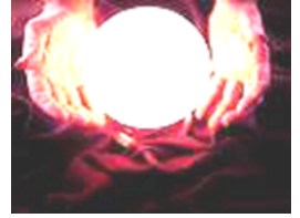
WE BECOME WHAT WE ENVISION