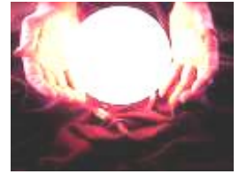
WE BECOME WHAT WE ENVISION

Welcome everyone to the 2008-2009 academic year. I am very honored to serve as BSUAOP's President for a second term. My theme this year is: "We Become What We Envision." When I chose this theme, I began to envision the upcoming year for BSUAOP and here is what I see: