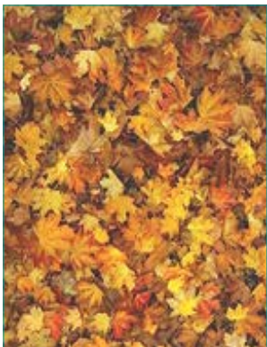
Autumn Leaves