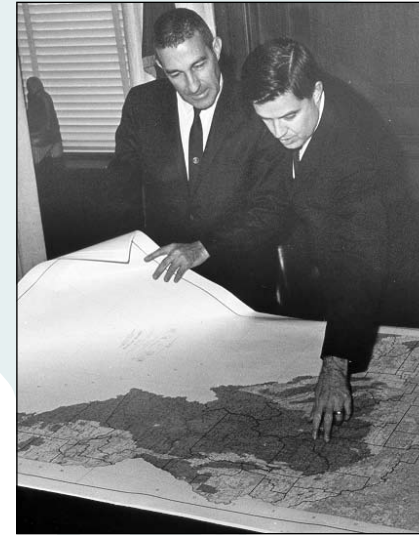
Secretary of the Interior Stewart Udall and Senator Frank Church, 1968.

Senator Frank Church "Give Earth a Chance" • April 15, 1970