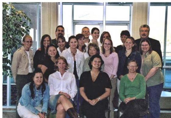
(Submitted Photo, Inductees of Phi Alpha April 2006)

You've all made last night a fantastic tribute to our new honorees.