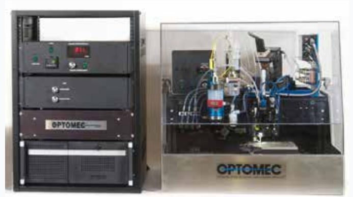
Aerosol Jet 200 Series System

Aerosol Jet 200 series systems provide a professional grade, compact benchtop print solution specifically developed for printing electronics. The system utilizes an innovative aerodynamic focusing technology that produces electronic and physical structures with feature sizes from 10 microns to millimeters.