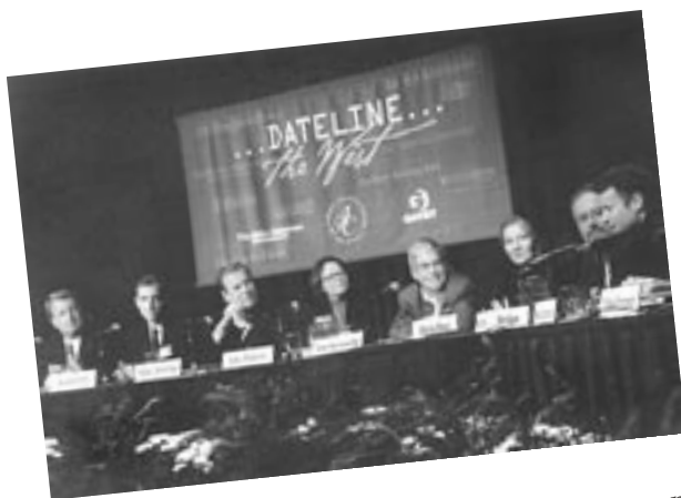
Panelists discuss the issues during the "Media's Struggle to Report the West" session.

A transcript of the entire conference and a conference report are available on the Andrus Center website ( www.andruscenter.org ) and may be downloaded without charge. Printed versions may be ordered through the Andrus Center.