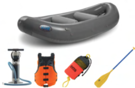
11'6" Puma Raft Paddle Package (4 people)