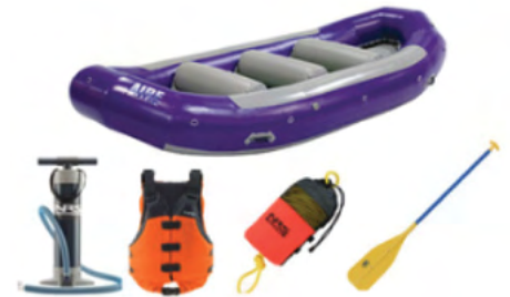
13' Raft Paddle Package (7 people)