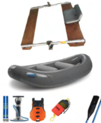
11'6" Puma Row Package