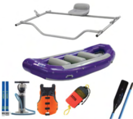
13' Row Package