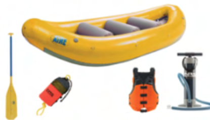
13' Super Puma Raft Paddle Package (7 people)