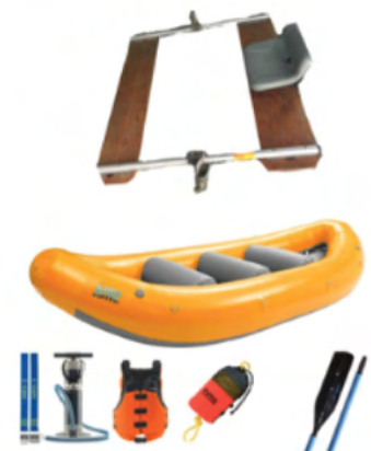
13'1" Super Puma Row Package