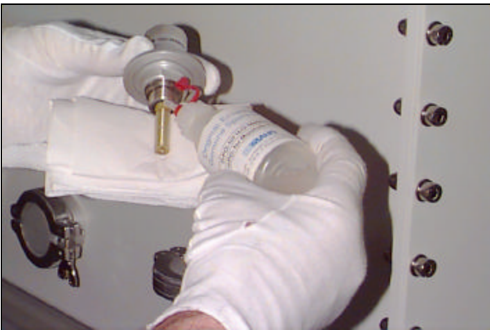
Moisten winding with phosphoric acid

Do not dry the sensor element. The surface of the insulating material should be still looking “wet”