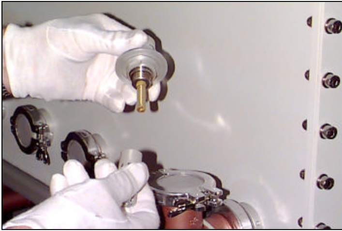
Unscrew protective cover

Unscrew the protective cover of the detector element as shown below!