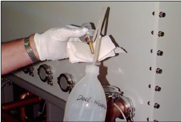
Cleaning the sensor with distilled water

Carefully clean the detector element by rinsing it with distilled water and wiping it (by turning) several times until no color can be seen on the cloth.